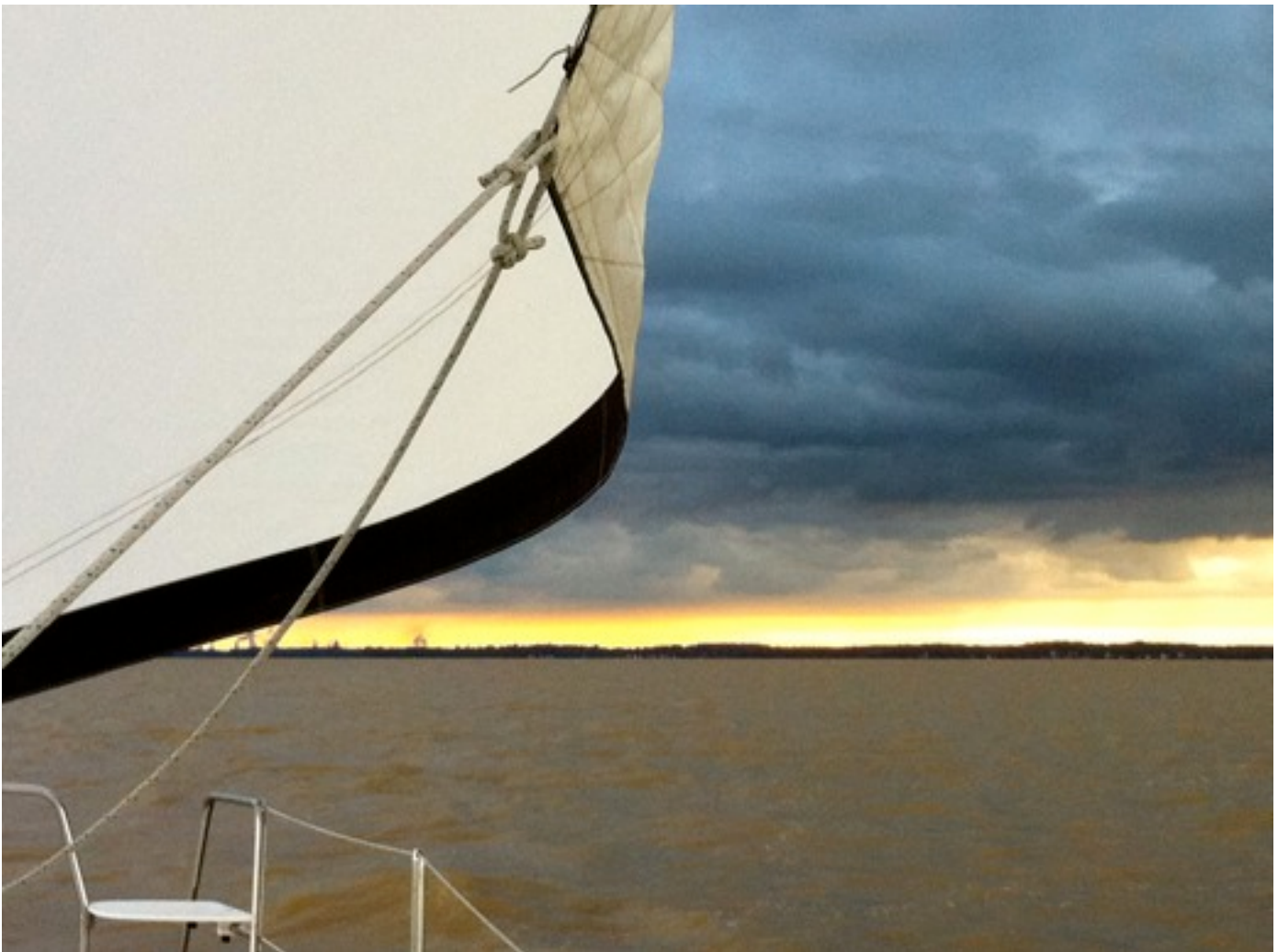
September 17, 2011 aboard "JollyMon" in Middle River