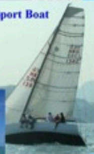
B32 Sport Boat