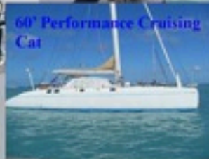
60' Performance Cruising Cat