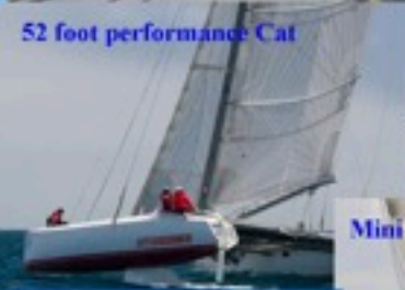
52 foot performance Cat