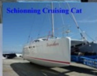
Schionning Cruising Cat