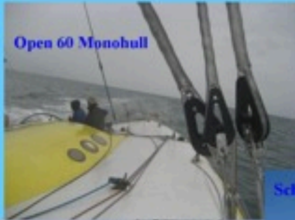
Open 60 Monohull