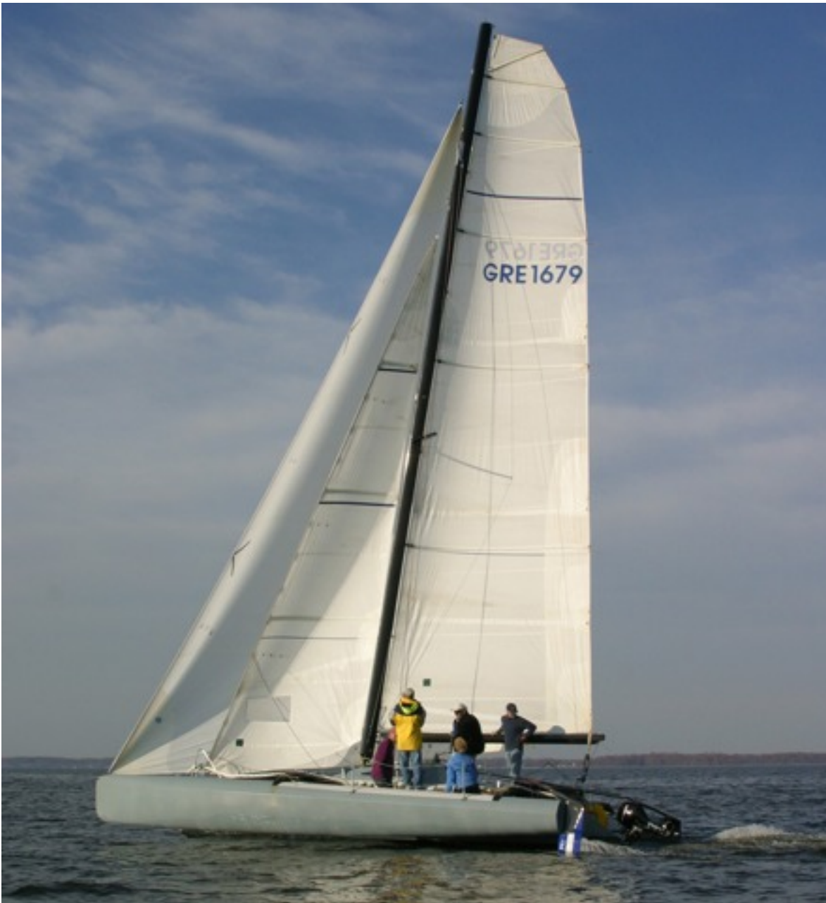
“Sundog” on West River, November 2010.