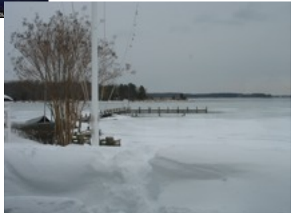
West River Sailing Club