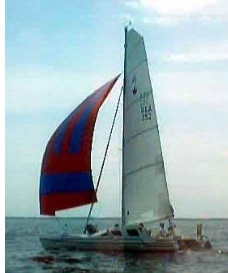
Seawind 24 Mistral