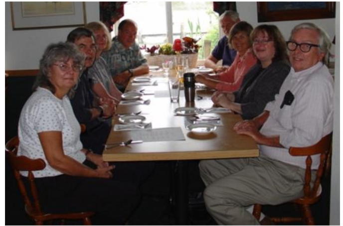
A table of happy Multihull Sailors