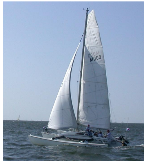
Condor 30 Tri My Way

(larger photo available on CCMA website)